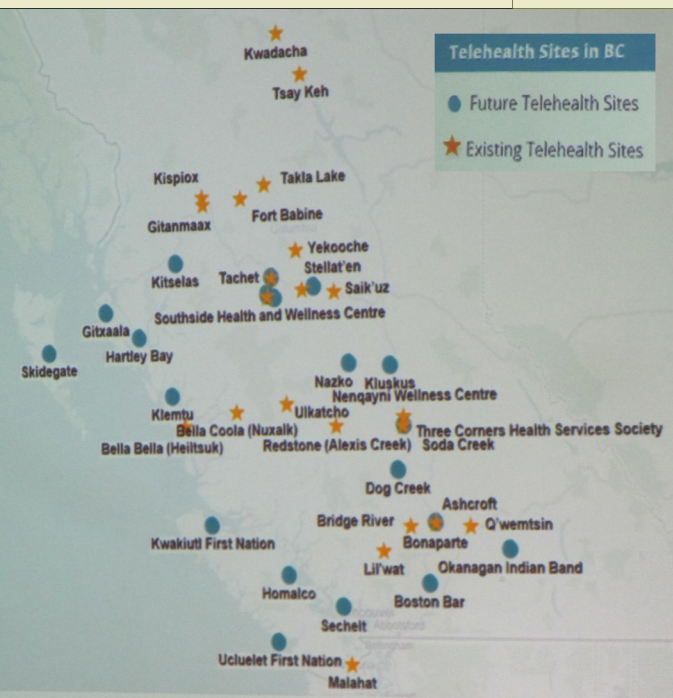
Left: This First Nations Health Authority map shows the existing and future planned Telehealth sites in British Columbia. With the new hepatitis C treatments so short, effective, and almost side-effect free, it is now more realistic for HCV+ patients in remote parts of the province to obtain treatment in their home communities with the assistance of local medical staff trained to use Telehealth technology connecting them with specialists in urban centres. While generally associated with a First Nations Wellness Centre, Telehealth services are made available to all residents, and are a tremendous asset to these Northern and remote communities.