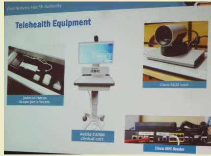
This First Nations Health Authority photo shows four main pieces of Telehealth equipment which can enable doctors to examine patients remotely. Staff in remote communities must be carefully trained in their use in order to produce accurate results.