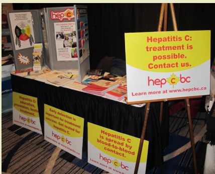
HepCBC's info booth at First Nations Health Authority "Gathering Wisdom" Health Fair, May 5-7, 2015.

We offered visitors ribbons and invited them to a free showing of the DEAL WITH IT film at Vancouver Island University on May 8 th . It was good to have something positive to offer the mall visitors and get their attention. Many mall visitors did a “double-take” when they saw a local group doing hepatitis C education.