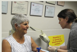
Carole James, Victoria/Beacon Hill