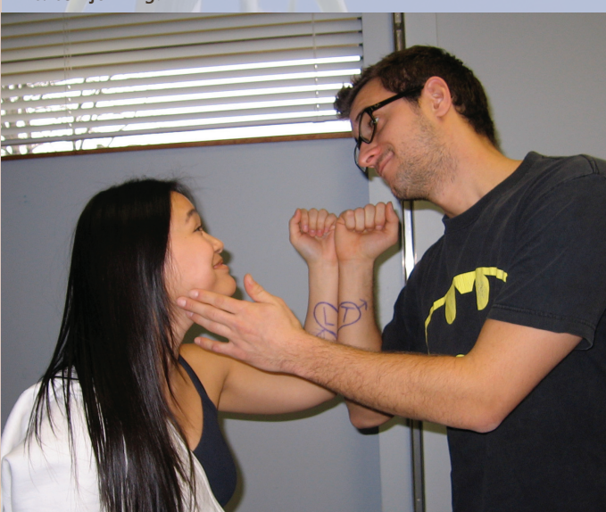
University of Victoria student volunteers rehearsing play to educate teenage audiences about hepatitis C risks

Mailings include no reference to hepatitis on the envelope. You may request "email only". Members may vote at our AGM or run for the Board 30 days after joining.