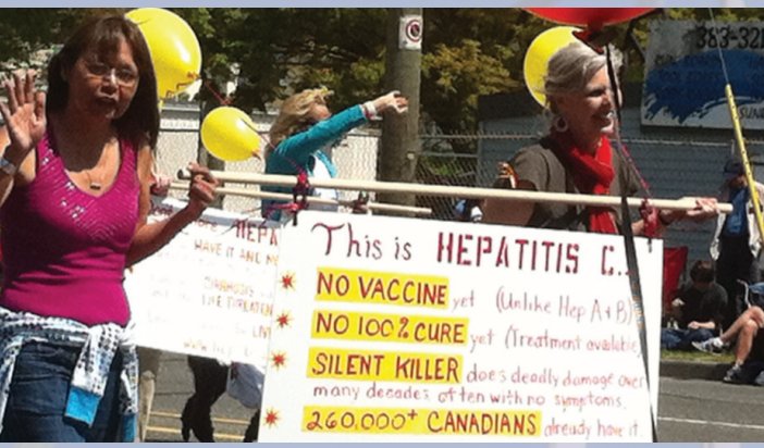
Community members support HepCBC's participation in the annual Victoria Day Parade