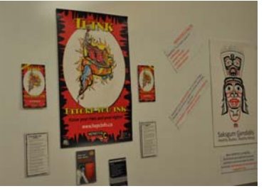
#2. Think Before You Ink poster display at new HepCBC office