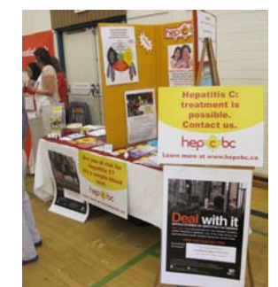
#7. HepCBC Info Booth at the 3rd annual Vancouver Island Refugee Centre Society's (VIRCS) Multicultural Food and Health Fair. We gave out lots of hepatitis C information, much in translated pamphlets from CATIE.