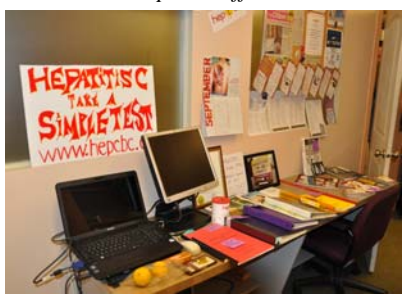
#3. There are 3 work stations at HepCBC's new office.