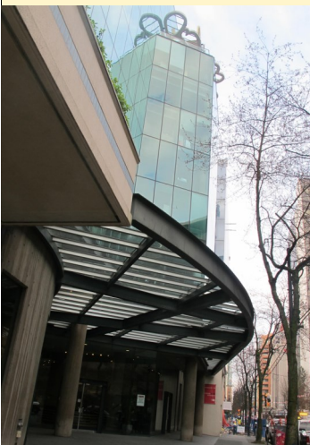
Photo left is of our elegant new office's building entrance, 938 Howe St. Vancouver.

Our Victoria office is still open, of course: Room #20, 1139 Yates Street, Victoria, BC V8V 3N2 Office phone: 250-595-3892