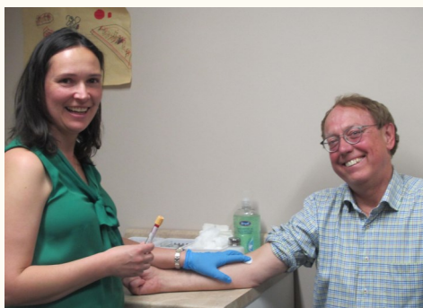
Murray Rankin, MP and Official Opposition Health Critic, is a Baby Boomer getting a one-time hepatitis C test, as specialists widely recommend for seniors.

On April 17, 2015, Official Opposition Health Critic MP Murray Rankin showed his support of Baby Boomer testing for hepatitis C by “rolling up his sleeve” for the simple blood test. HepCBC was there to record this special occasion which took place in Victoria’s Percuro Clinic. We applaud this kind of “hands-on” action, which shows leadership on the important health issue of un-diagnosed hepatitis C.