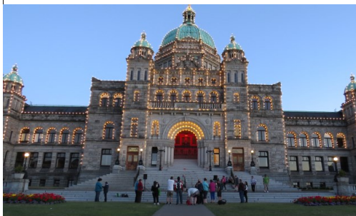
Lighting up of the BC Legislature in Victoria, BC on WHD 2015